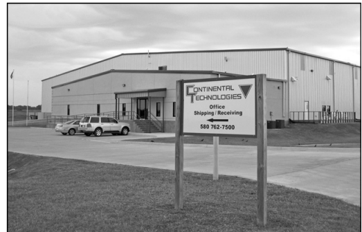
Continental Technologies, 2405 Sykes Boulevard, is one of the new premiere industries to locate in Ponca City. The building, previously known as "Bob," was constructed by the Ponca City Development Authority as a "spec building," to attract industry to town.